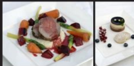
barbecues • cocktail parties • picnics