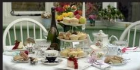
wedding breakfast • vintage teas