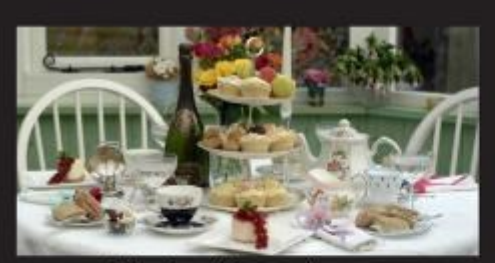
wedding breakfast - vintage teas

Tel: 01780 481356 Mobile: 07716 719329 Email: debswelton@yahoo.com