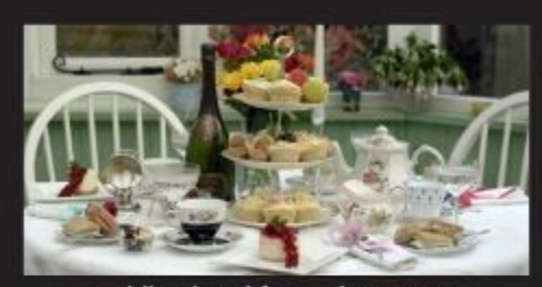
wedding breakfast • vintage teas

Next Meeting: 10th January 2023 at 19:30hours.