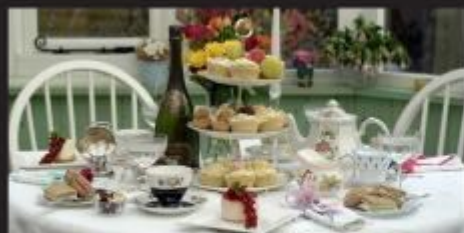
wedding breakfast • vintage teas