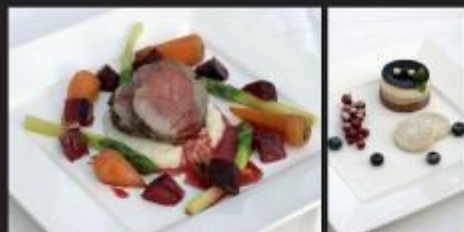
barbecues • cocktail parties • picnics