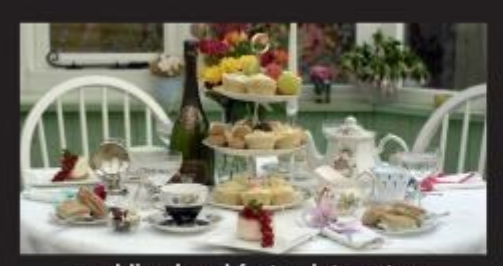
wedding breakfast • vintage teas