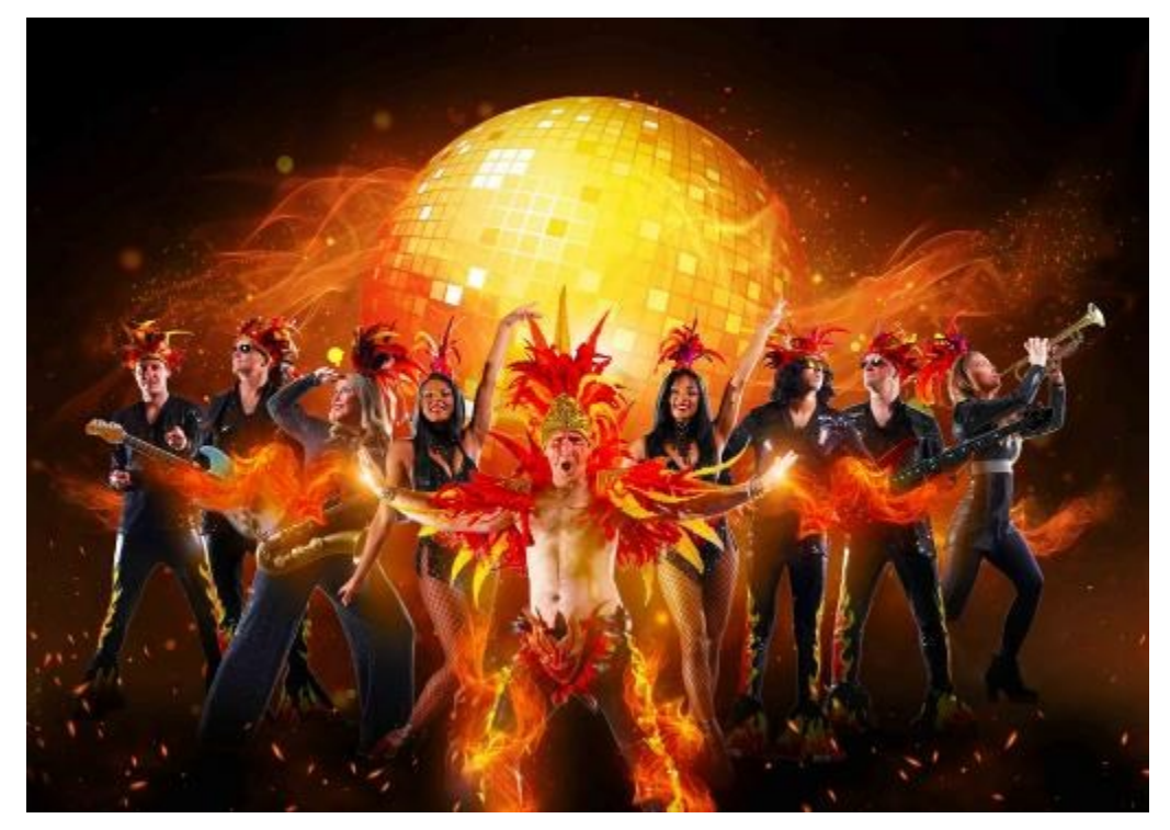
Uncle Funk's Disco Inferno: The UK's Premier Disco Covers Band Set to Light Up the Stage at Bourne Corn Exchange

Get ready to put on your dancing shoes and relive the magic of the disco era as Uncle Funk's Disco Inferno, the UK's top disco covers' band, takes centre stage at the Bourne Corn Exchange on 21st October.