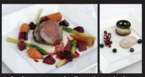
barbecues - cocktail parties - picnics