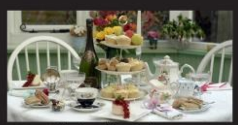
wedding breakfast - vintage teas