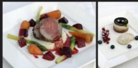
barbecues • cocktail parties • picnics