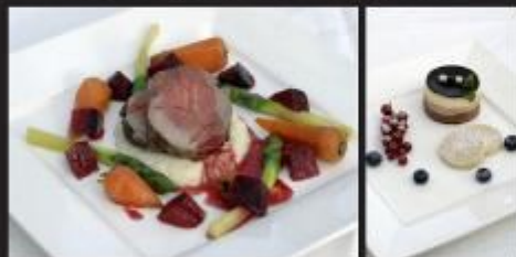
barbecues • cocktail parties • picnics