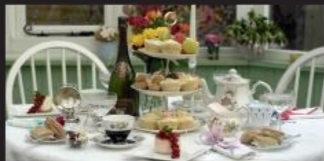
wedding breakfast • vintage teas