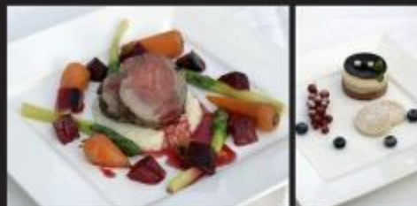
barbecues • cocktail parties • picnics